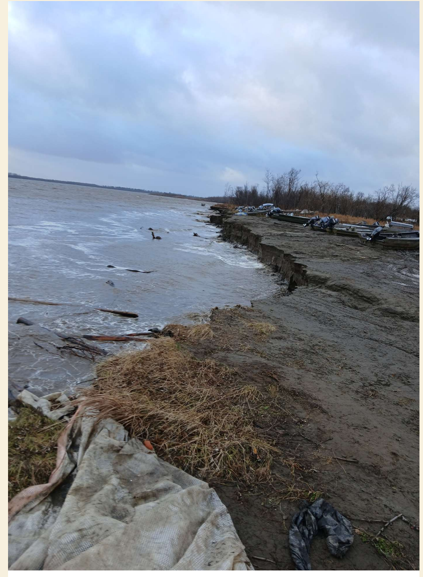
251012 AKI MR bank area lost to storm _103628